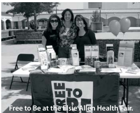
Free to Be at the Elsie Allen Health Fair.

The web cast, titled Free to Be Teen Panels: A Peer-to-Peer Approach, can be accessed through the Pal-Tech web site at any time. Go to http://abstinence.pal-tech.com/resources/ and click on Web Casts.